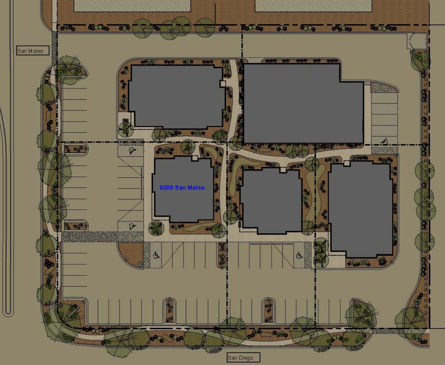
Site Plan 9200 San Mateo NE Albuquerque NM